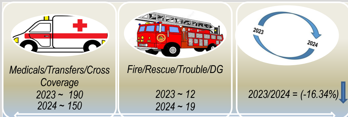
Month of FEBRUARY 2023/2024 call volume at a glance