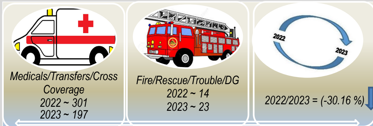
Month of JULY 2022/2023 call volume at a glance