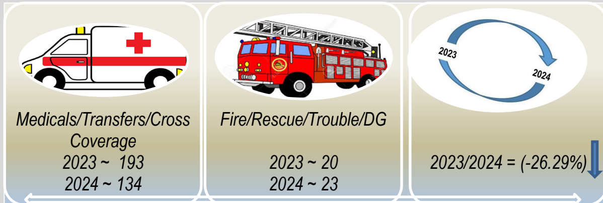
Month of JUNE 2023/2024 call volume at a glance