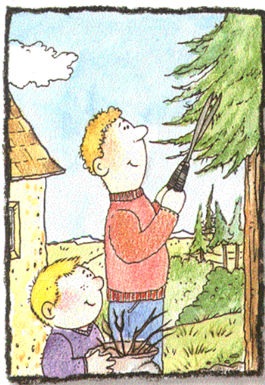
Prune trees regularly