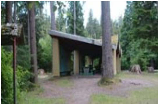
COVERED PICNIC AREA

Nearby, the Kitimat River and Douglas Channel provide popular year round fishing opportunities. Boat charters are available for the Douglas Channel.